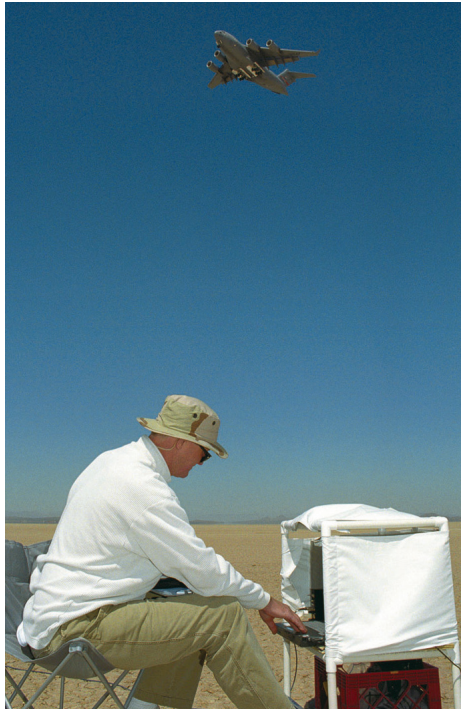
An engineering student from California Polytechnic State University at San Luis Obispo, Calif., sits on Rogers Dry Lake Bed to record the noise footprint of the C-17 Globemaster III, during a noise mitigation study being conducted by NASA.

The military incorporates the results of noise studies in its noise reduction efforts, Joint Land Use Study (JLUS) Program, and other compatible land use programs including the including the Air Installations Compatible Use Zones (AICUZ) Program, the Navy Range Air Installations Compatible Use Zones (RAICUZ) Program, and the Marine Corps Range and Compatible Use Zones (RCUZ) Program. These programs promote outreach between installations and local communities that will help protect public health and safety, as well as preserve the operational utility of the installation. DoD also uses the results of noise studies to identify potential REPI projects and support funding decisions that prevent incompatible development around ranges and airfields. Noise studies are also used during strategic basing decisions and National Environmental Policy Act (NEPA) analysis.