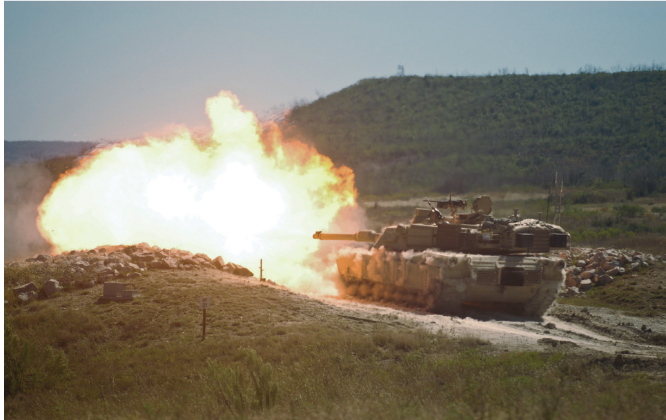
2nd Armored Brigade Combat Team, 1st Cavalry Division M1 Abrams tank during gunnery training at Fort Hood, Texas.

need to conduct high-quality testing and training throughout the year. Negative community reactions to military noise are often a challenge to this essential training. As a result, the Military Services focus a significant amount of time and resources on studying, communicating, and addressing noise generated by military activities to protect essential testing and training.